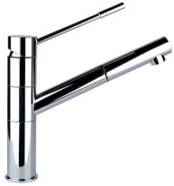
Mixer Tap Lorenzo