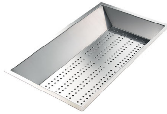
Stainless steel perforated tray

* only in combination with the accessory 8644 101