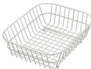
White basket 8612 100