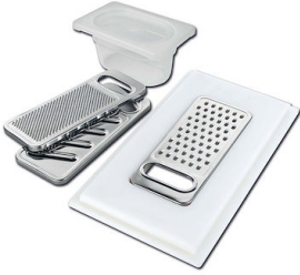
Graters kit with ring-holder and food collection tray