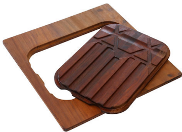
Iroko-wood twin chopping board 8644 004