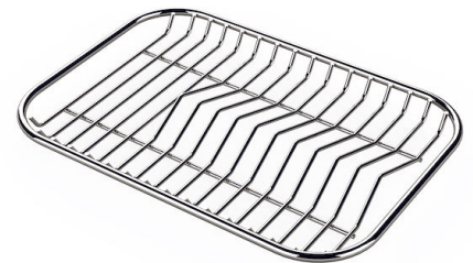
Stainless steel plate rack 8100 154