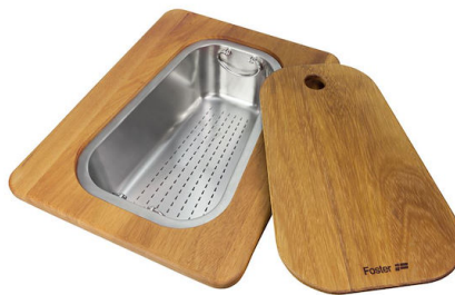
Iroko-wood chopping board with stainless steel colander 8644 042