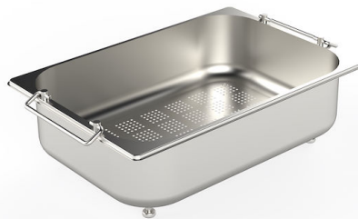
Stainless steel colander 8154 000