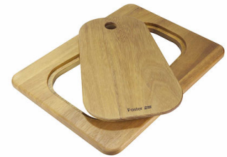
Iroko-wood sliding chopping board 8644 041