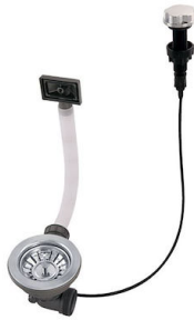
Automatic waste fitting