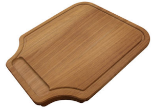
Iroko-wood chopping board