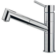
Mixer Tap F2000 - Basso