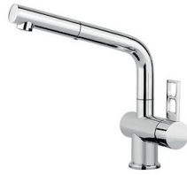
Mixer Tap Luisa