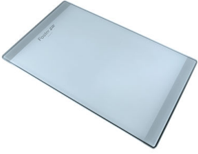
Glass chopping board