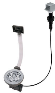
LIRA automatic waste fitting