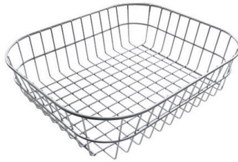
Stainless steel basket