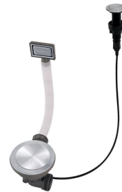
Space Push automatic waste fitting 8407 116