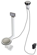
Space Light automatic waste fitting 8407 117