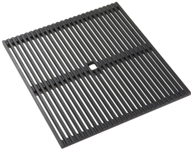
Black grid 8100 600