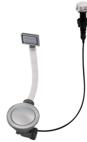
Space automatic waste fitting 8407 109