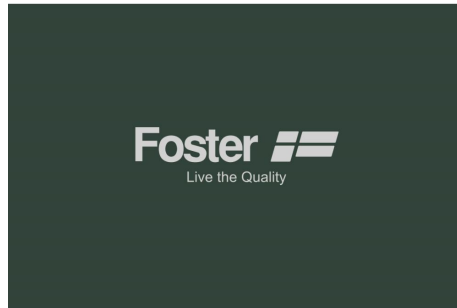
Space Milano automatic waste fitting 8407 115