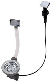
Automatic waste fitting 8407 113