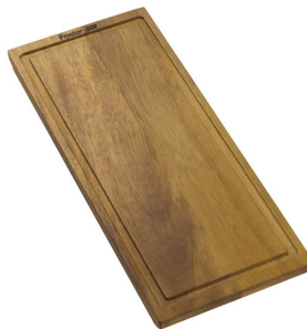
Walnut-wood chopping board 8642 000